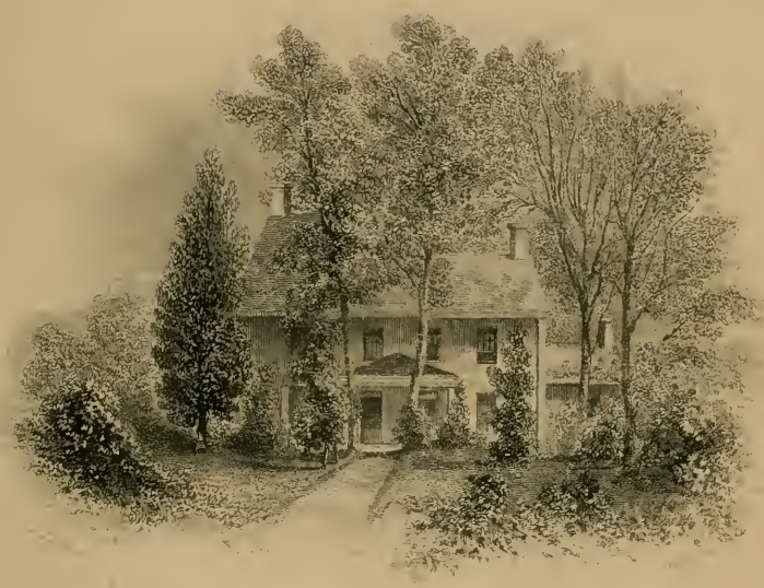
The Homestead, Chester Co. Penn.